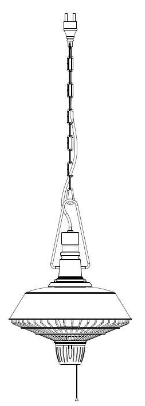
Please read these instructions carefully before using your new heater

U npack the heater to make sure that all the items are present and that there are no components left in the box and that the heater head is free from any packing material.